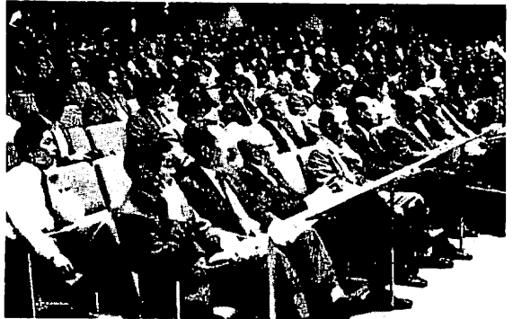
Commemorative Gathering on the 40th Anniversary of the United Nations