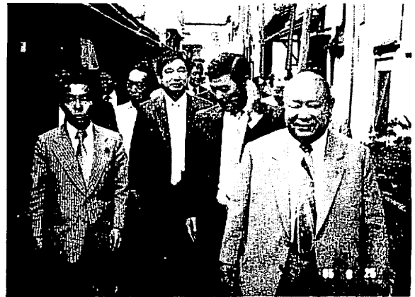
Labor Minister Yamaguchi (far left) visits Osaka Buraku.

Following this, the visitors made a walking tour through narrow and winding streets. They first came to the house of a shoe-maker couple. Minister Yamaguchi, noticed a very old-fashioned sewing machine and asked, "Are you planning to buy a new